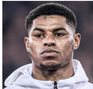
Marcus Rashford – Footballer and campaigner

You can practice listing education, roles, campaigns, and key achievements.