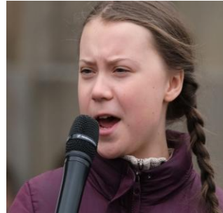
Greta Thunberg – Environmental activist

You can highlight leadership, teamwork, charity work, and discipline.