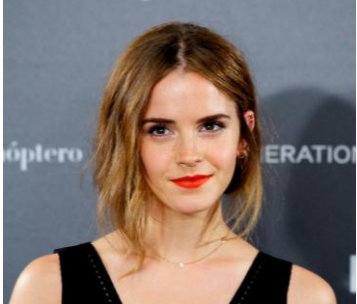
Emma Watson – Actress and activist

Imagine you are one of the personalities below and create a CV for them.