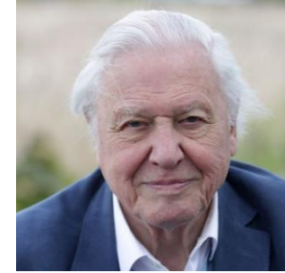
Sir David Attenborough – Broadcaster and natural historian

You can focus on achievements, media appearances, and advocacy experience.