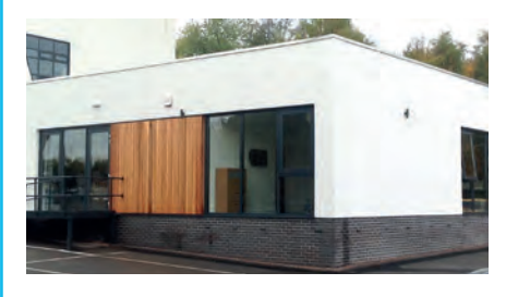
Aspire Brierley Hill